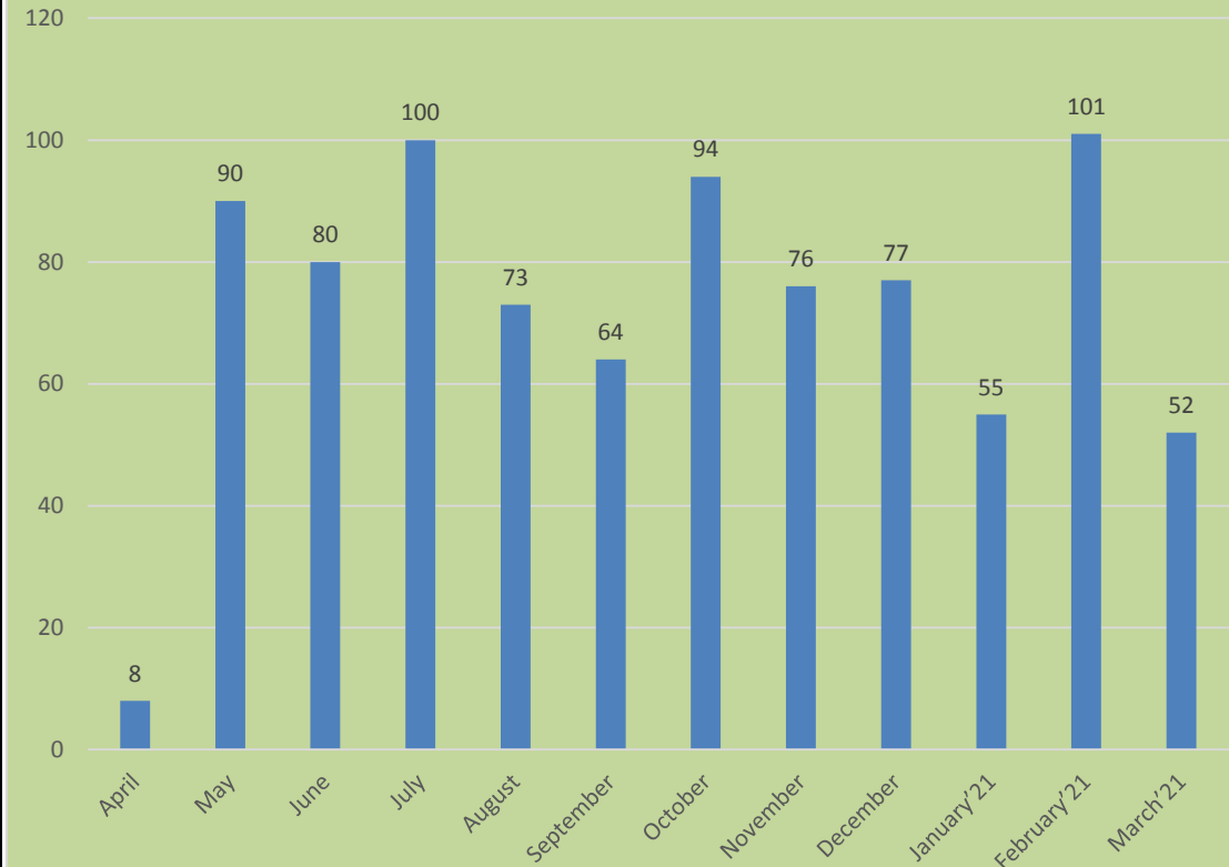
Month wise No. of Applications Received under Right to Information Act, 2005 w.e.f. 01.04.2020 to 31.03.2021